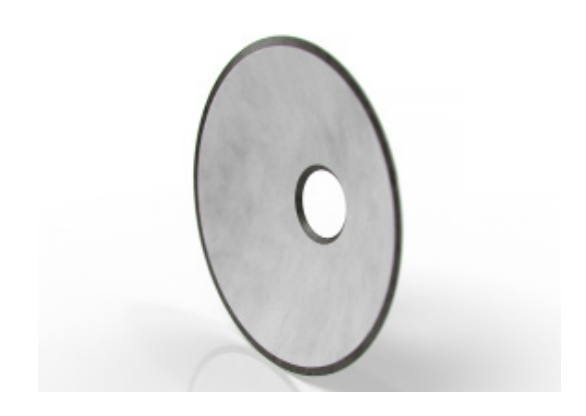
Focusing bowl in piezoelectric ceramic material

Smaller transducers called linear arrays can be inserted into body cavities to emit ultrasonic energy internally to for instance dissolve a blood clot or stimulate muscle recovery. Larger, two-dimensional arrays are instead used for extracorporeal radiation.